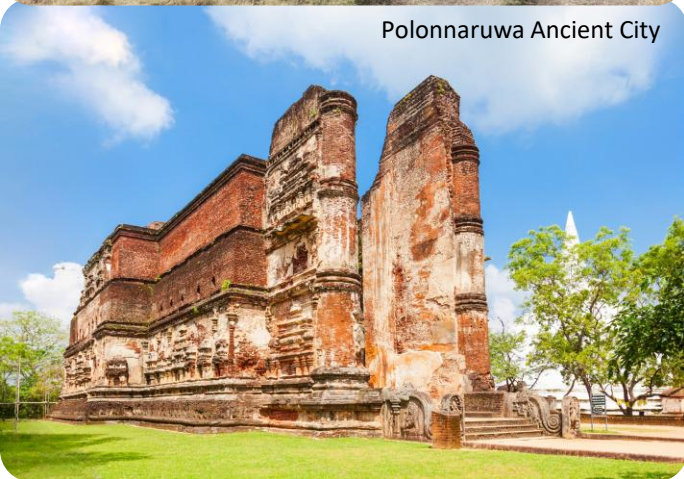
Polonnaruwa Ancient City