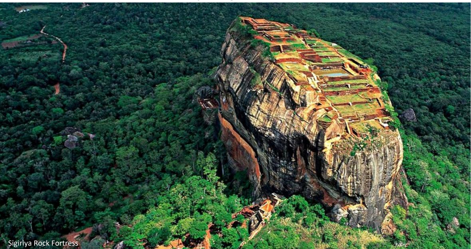
Sigiriya Rock Fortress